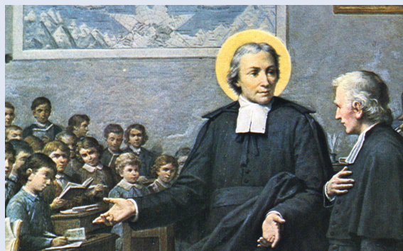
De La Salle perceived the mission of education as a mission of the Church and a mission of the teachers.

Brothers and lay educators in Lasallian schools are co-responsible for a common mission. The Lasallian mission of human and Christian education is by its very nature today a shared mission. It is a mission of the Church, something that comes through the Holy Spirit and is actualized through the very being of the Church, a Church that consists of laity, religious, priests, and bishops. When we speak of "shared mission" we do not speak of a mission that the Brothers "had" and now "share"; we speak of a mission that the Church "has" and "shares" among all of her members, a mission that the Lasallian heritage has lived out, still lives out, and continues to live out with a particular nuance, a characteristic flavor, a specific character.