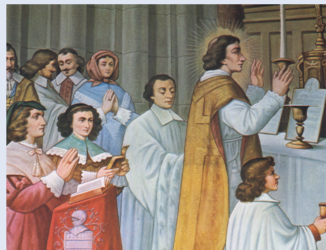
A devotional painting of De La Salle at Mass

The primary task of these Christian Schools (“Catholic Schools” in 17th century French terminology) was to bring the young to understand and enter into the “principal Christian mysteries” – the Trinity, the Incarnation, the Redemption, and so on. In 17th century French spirituality, the Christian makes explicit acts of